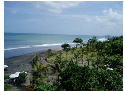
View from unit 503 facing North-West