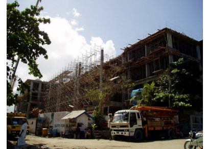
Taken from the side road of Gado-Gado Restaurant

Anantara Seminyak provides you with its best location "Absolute beachfront".