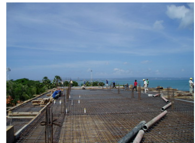
Putting concrete to future Roof Top Lounge & Bar