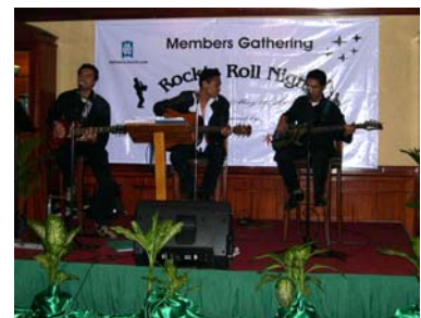
Live Rock and Roll Band entertaining the guests