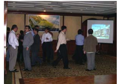
Guests were watching Anantara video presentation

This is part of Anantara's commitment to make people aware of our property in Asia and especially Anantara Seminyak, Bali.