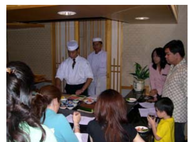
Participants of Japanese cooking class sponsored by Anantara Seminyak