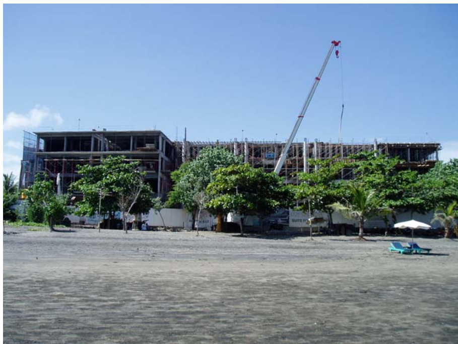
Anantara project taken from the beach